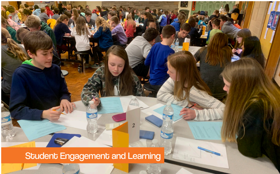
Student Engagement and Learning